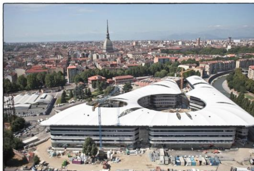
Campus Luigi Einaudi

This meeting will have plenary, invited and contributed sessions. Note that there are no parallel sessions. An extensive poster session will be held as well.