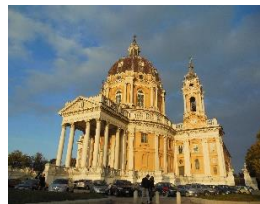
Basilica di Superga